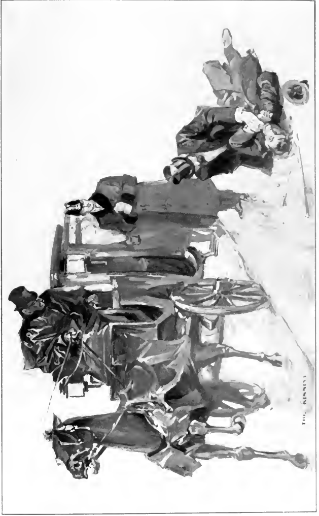
The Prince smiled and stepped into his carriage.